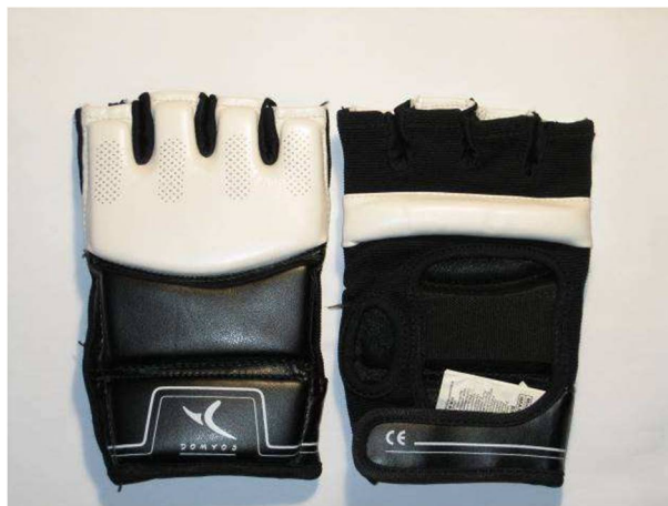
GLOVES (FROM 14 TO 17 YEARS OLD)

Another type of protections will be allowed if they offer the same level of protection.