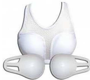
CHEST PROTECTOR FOR GIRLS