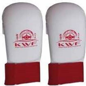
GLOVES (FROM 12 TO 13 YEARS)